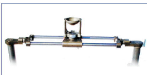
The GF-Bangi as a tracking system

The identical end connections accept either the counterweight rod (vertical or horizontal) or a Euro-adapter Fitting which in turn accepts either the Double Euro-adapter or the Combi-rig tubes.