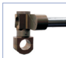
Adapter for GF-Bangi to Scaffold tube