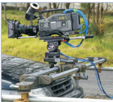
GF-Bangi in use as a car mount