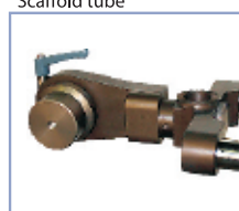
Solid, 360° rotation