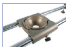
Low slider for Bowl or Michell