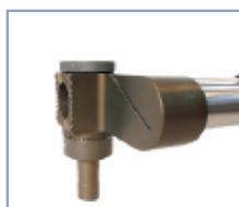
Lighting stand adapter